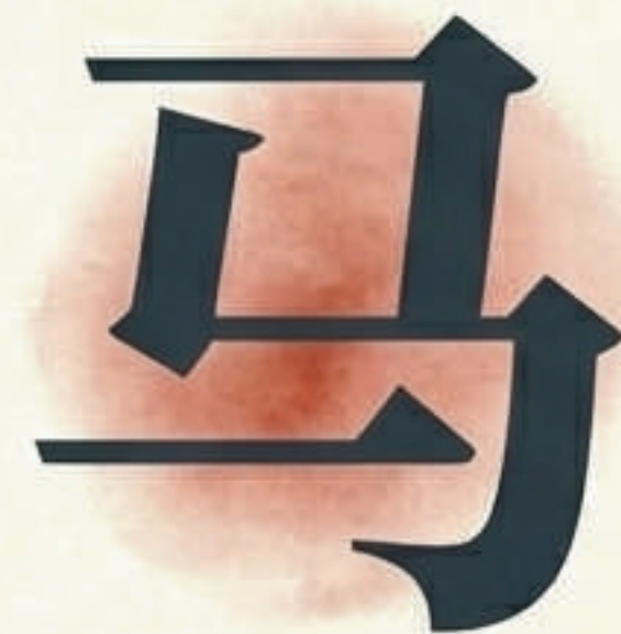
Modern Form: Simplified for Speed.

The character for 'horse' is a classic pictogram. Understanding its visual roots is a key to unlocking the Chinese script.