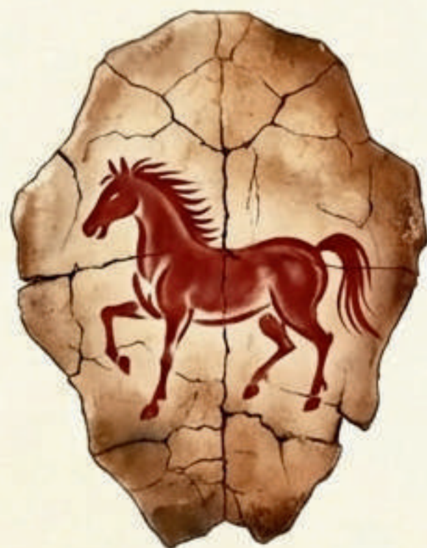
Oracle Bone Script: A Literal Picture.