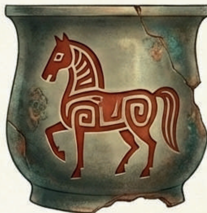
Seal Script: Tamed and Stylized.